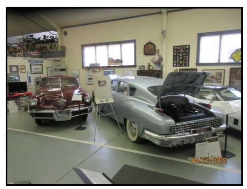
Tuckers at Swigart Museum