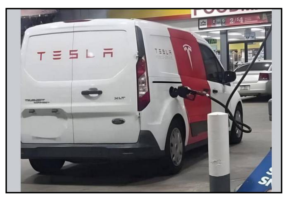
When you want to make sure you can get there with your EV