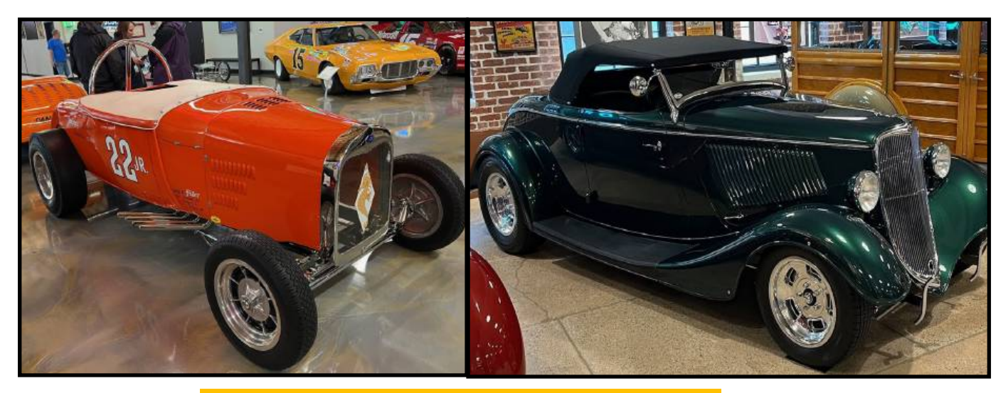
Click on this link to see all the 3Dog Pictures

We had approximately 28 members and guests in attendance. It was again a rainy dreary day outside but everyone left in awe after viewing the contents of the buildings.