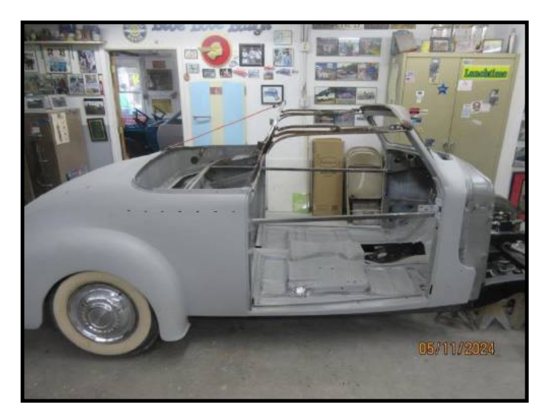
40 Pontiac at Old Stillwater Garage