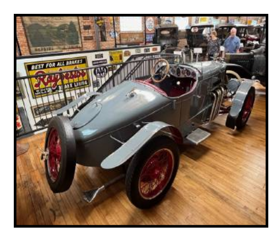
3 Dog Garage